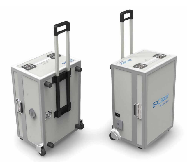
Front and Back of GoCabby