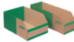
B-Range K-Bins Supplied In Packs Of 25