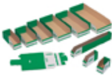
A-Range K-Bins Supplied In Packs Of 50